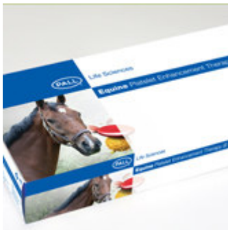
E-PET Equine Platelet Enhancement Therapy